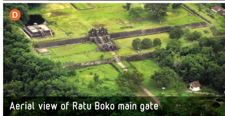
Aerial view of Ratu Boko main gate