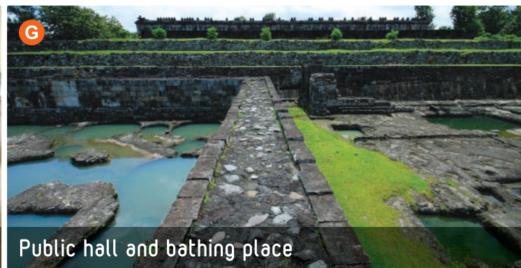
Public hall and bathing place