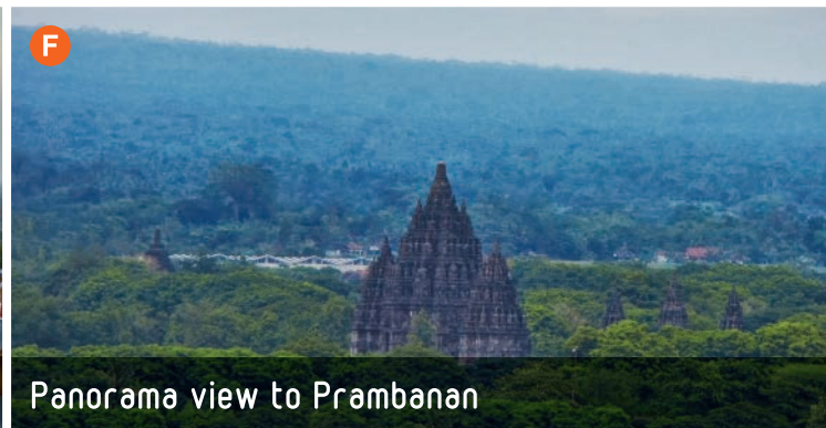
Panorama view to Prambanan