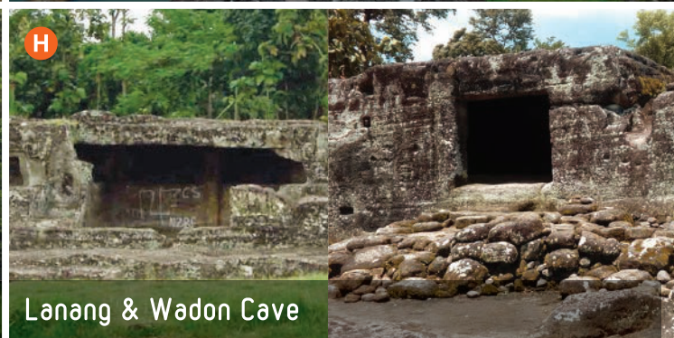
Lanang & Wadon Cave