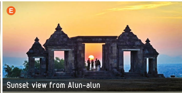
Sunset view from Alun-alun